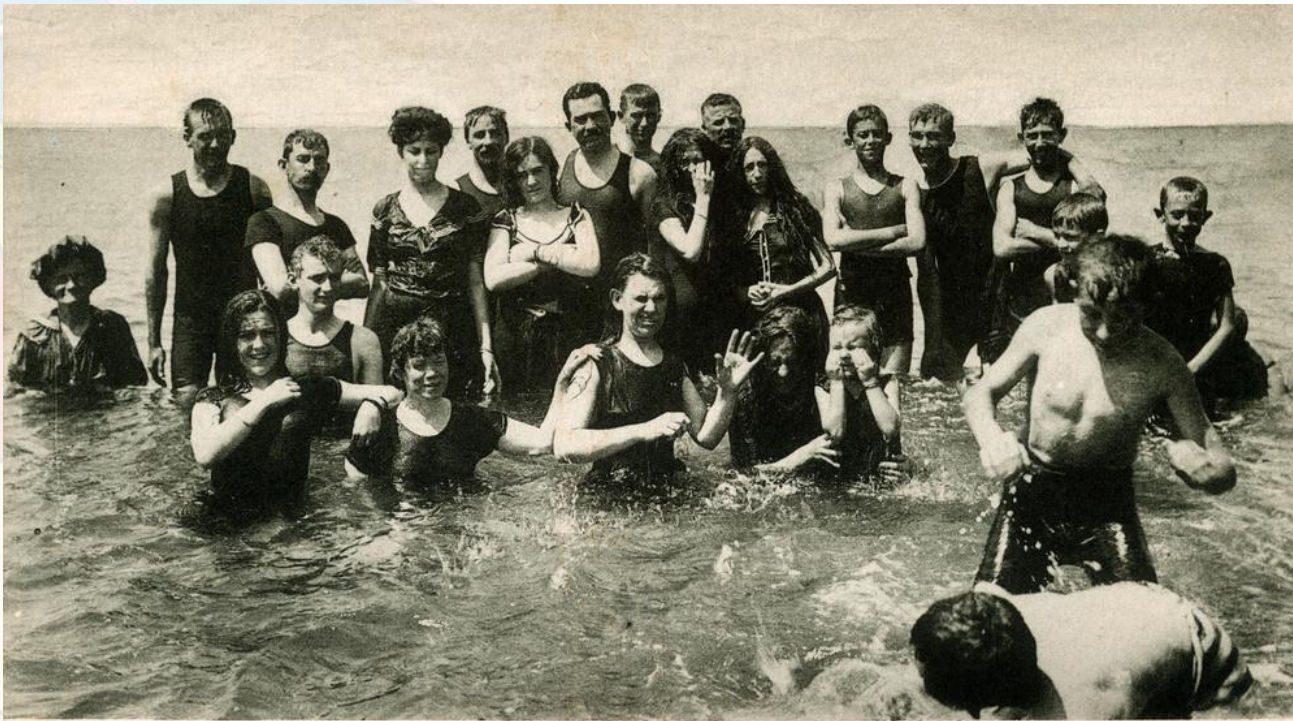
Mixed Bathing, Redcliffe, Qld.

Sunbathing wasn't in fashion back then, so Victorians would go to the beach fully clothed. 'Sea bathing' was done instead.